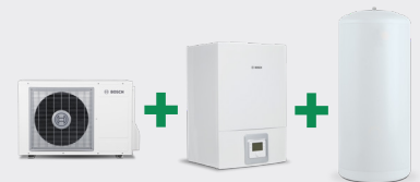
Outdoor unit / Indoor unit / Cylinder

Flexible and future-ready, the CS3400i is available in 4 outputs: 4, 6, 8 and 10kW, and as a heat pump or hybrid heat pump system set-up, making it a great choice for many homes.