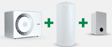
Outdoor unit / Cylinder / Indoor unit

Your installer will help you configure the best set-up for your home from the two options.