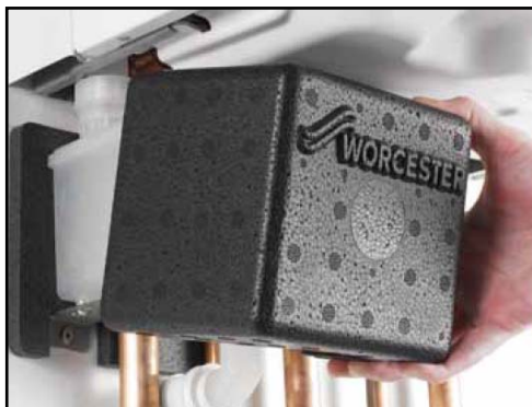
Fig 1: Image of CondenseSure

If an internal termination is not possible then an external run and termination is acceptable providing precautionary actions are taken to reduce the potential for the condensate to freeze. With this in mind, Worcester have designed an innovative solution to reducing the freezing potential, the CondenseSure.