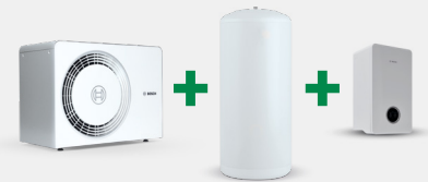
Outdoor unit / Cylinder / Indoor unit

Your installer will help you configure the best set-up for your home from the two options.