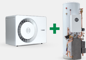
Outdoor unit / Pre-plumbed cylinder

Short on time or space? Our all-in-one pre-plumbed cylinder saves space and installation time, tucked away inside your airing cupboard. You'll be up and running in no time.